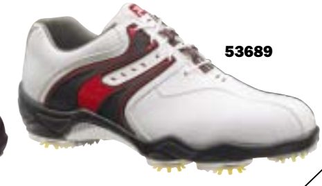
Black TPU saddle and black smooth waterproof leather. Laser Plus Last.